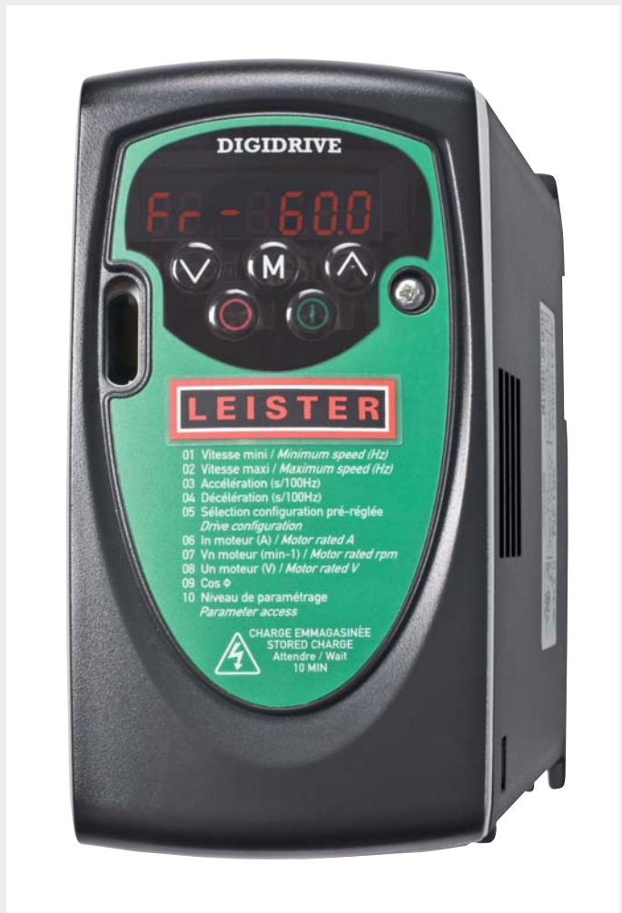
Leister FC 550 frequency converter

Up to now, the air volume was reduced via a mechanical hand controller. With the FC 550 frequency converter it is possible to set the rotational speed exactly to 1 Hz and show it on the built-in display. Different processes require different air volumes. It is possible to control this through a PLC via a 4-20 mA/0-10 V interface. Or you select one of four pre-set frequencies via external relays.